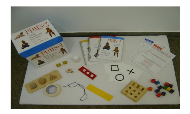
Figure 4: PDMS-2 Test Materials